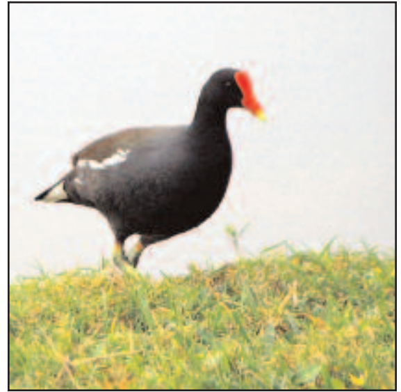
A Moorhen