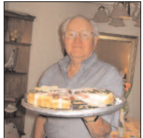
"Anyone for dessert?"